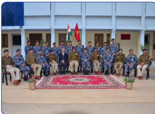
1 st C&SC Student officers during Foreign Study Tour at SSB Academy, India