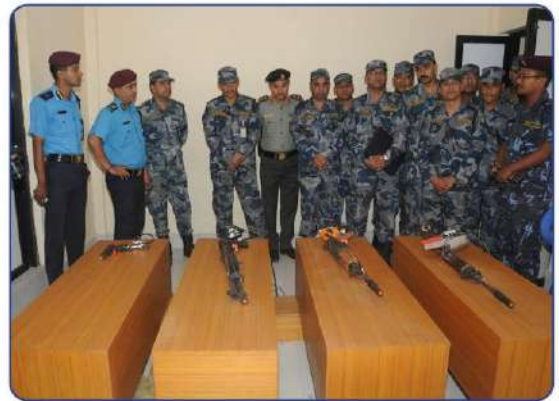
2 nd C&SC Student Officers at Bhartapur Training College, Nepal Police