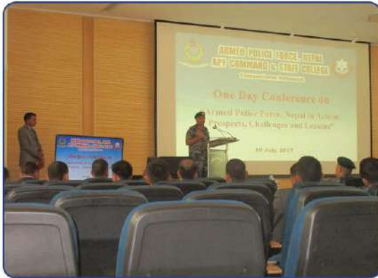
Conference: APF,Nepal in Action Prospects,Challenges and Lessons,Organized by APF C&SC