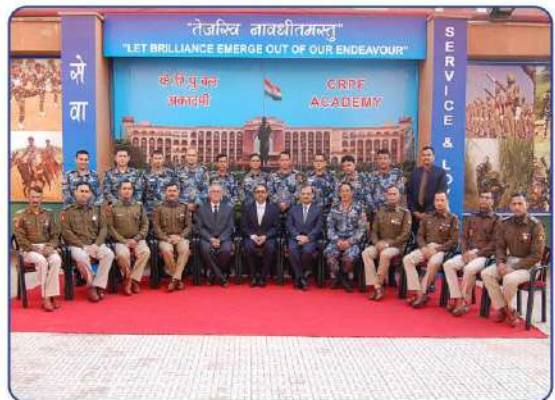
2 nd C&SC Student officers during Foreign Study Tour at CRPF Academy, India