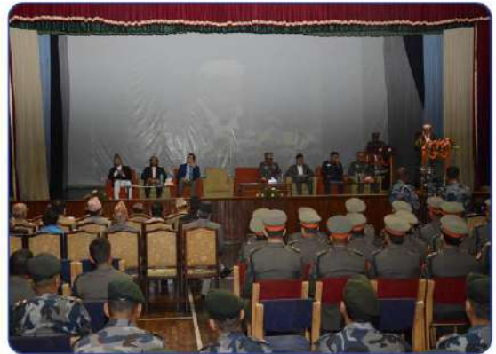
2 nd C&SC Student Officers at Joint Conference Organized by APF C&SC and MIRD, TU