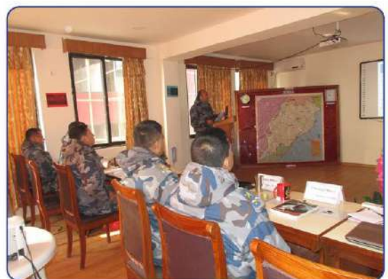
2 nd C&SC Student Officers during Professional Exercise