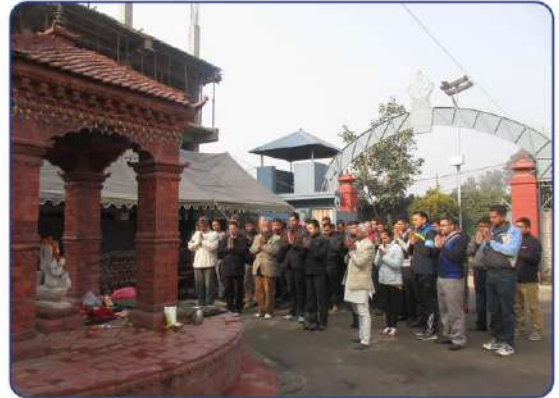
Offering Prayers to Goddess Sarashwoti during Saraswoti Puja in College Premises