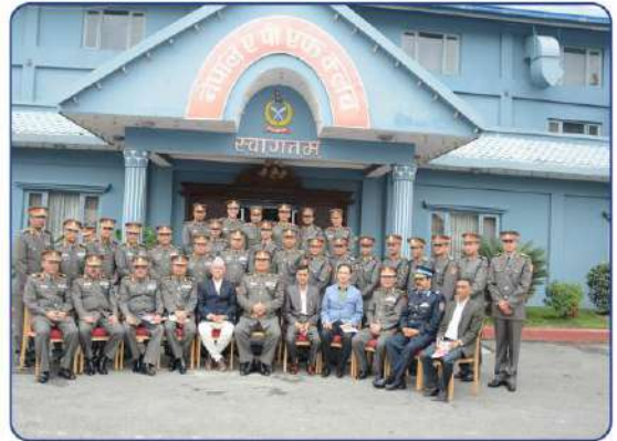
Opening Ceremony of 2 nd Command and Staff Course