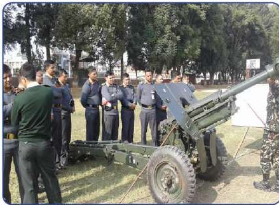
2 nd C&SC Student Officers at Rajdal Bn of Nepal Army