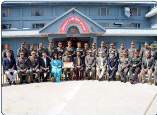
1 st C&SC Graduated Officers with Dignitaries in Graduation Ceremony