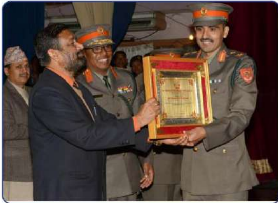
Hon'ble Deputy Prime Minister and Home Minister Bimalendra Nidhi awarding certificate to Student officer