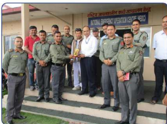
2 nd C&SC Student Officers at NEOF, MoHA