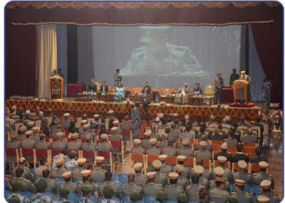
Opening Ceremony Session: 3 rd C&SC