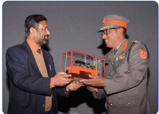
IGP Singha Bdr Shrestha presenting token of love to Hon'ble Deputy Prime Minister and Home Minister Bimalendra Nidhi