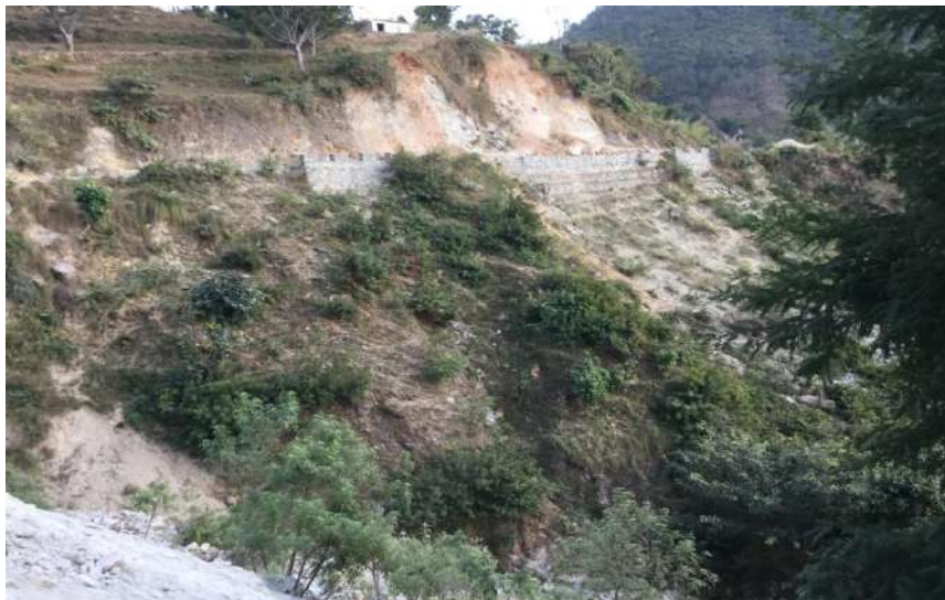
Figure 2. Bad road-cut prace as a threat multiplier

For security agencies all of the above issues have emerged with challenges. In context of absence of much relevant and needed data, meaningful interventions are very limited. And the resultant effect will put large population in an uneventful environment due to impacts such as flooding, road disaster where security agencies' role increases as in the time of "Gorkha" Earthquake of 2015 in Nepal. The earthquake killed more than 9000 people, displaced hundreds of thousands and devastated infrastructure and affected overall livelihood of people. It is therefore key to effective qualitative judgments to manage appropriate intervention taking into consideration of ecological factors that contribute to political, economic, and social forces to effective national security agencies' roles and