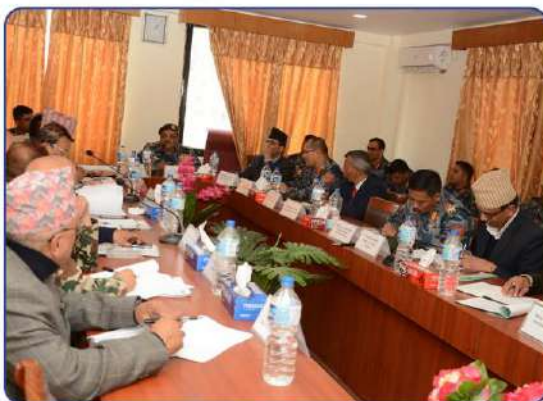
Panel Discussion on Border Management & Security at College