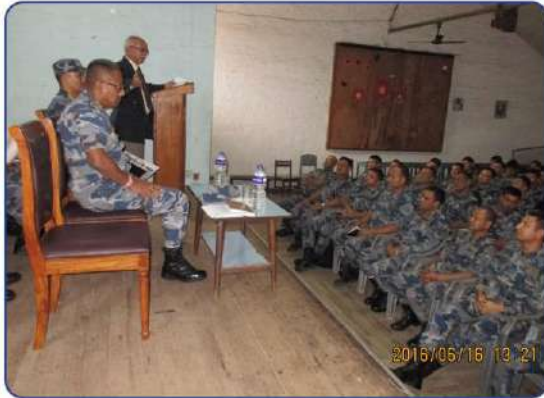
Orientation Program of C&SC Entrance Exam to Eligible Candidates