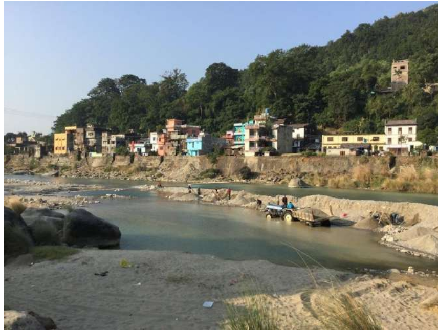
Figure 1. Sand-gravel mining as multiplier effect

Because of receding water in our villages' dry out springs at the local level and growing demand for water in increasing urbanization and free market based society deplete and pollute groundwater. The receding Himalayas glaciers regionally and increasing population are quite a stress into natural resources system, hence these concern are important to the national security agencies which has cross boarder environmental ramification in terms of air, water and soil pollutions. All of these add to and affected by the kind of "development" country is undergoing contemporaneously.