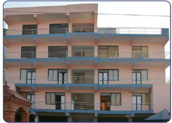
Newly Constructed Building of C&SC