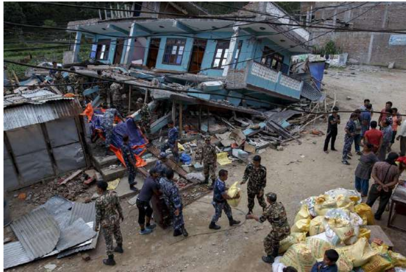
Figure 3: Security agencies involved in April 29, 2015 Earthquake in Nepal