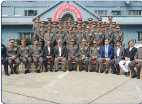
Opening Ceremony of 3 rd Command and Staff Course