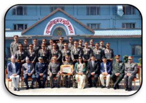
Graduation Ceremony of 6<sup>th</sup> APF Command and Staff Course