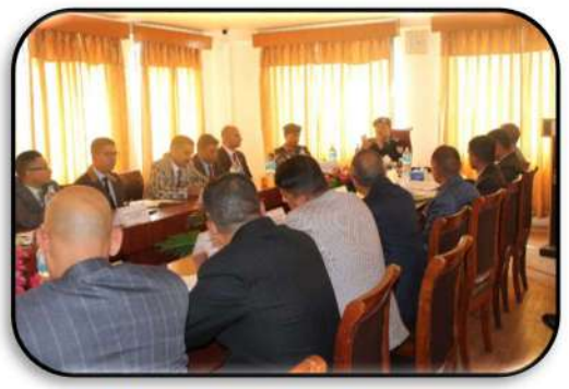
IGP Dhiraj Pratap Singh interacting with Student Officers of 7th APFCSC