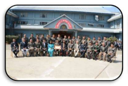
Graduation Ceremony of 1<sup>st</sup> APF Command and Staff Course