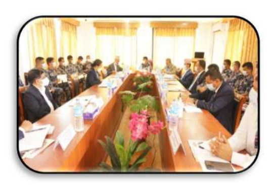
Panel Discussion on Border Management and Security 2078