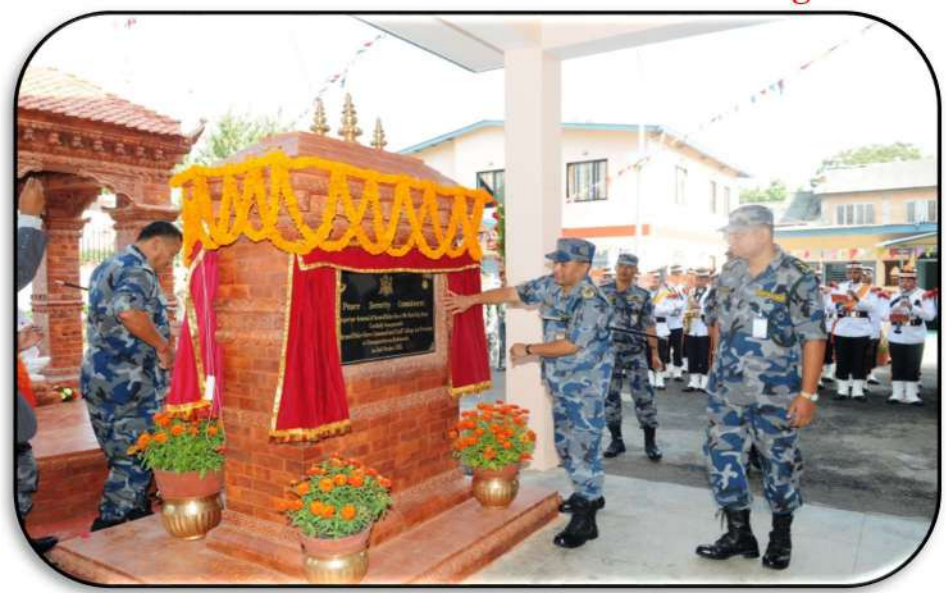
Inauguration of APF Command and Staff College by the then IG Koshraj Onta