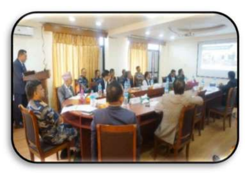
Panel Discussion on Border Management and Security 2079