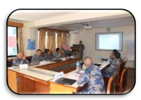
DM Exercise of 7th APFCSC