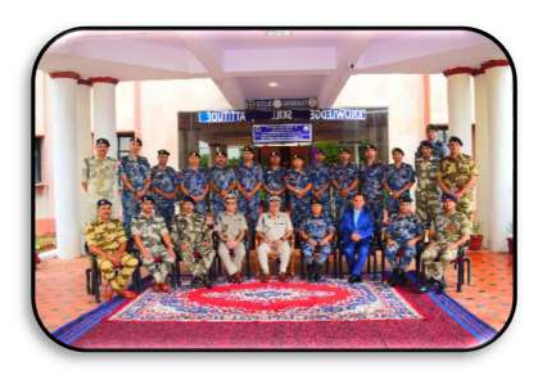
Foreign Study Tour 6th APFCSC