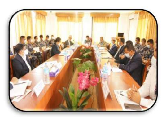
Panel Discussion on Border Management and Security 2078