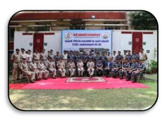
Foreign Study Tour 6<sup>th</sup> Batch