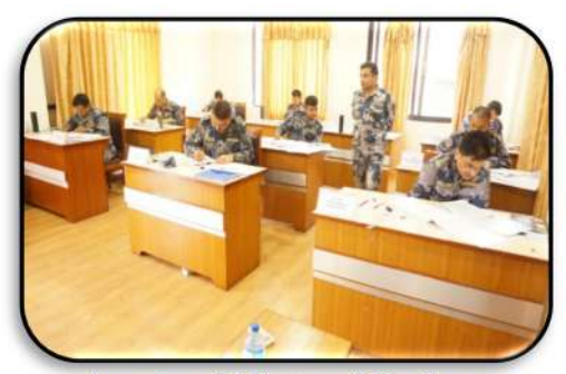
Agenda and Minutes of Conference of 6<sup>th</sup> Batch