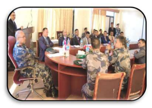
Post FST interaction between Inspector General and Student Officers