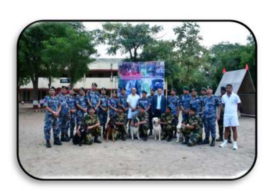
Foreign Study Tour 6<sup>th</sup> Batch