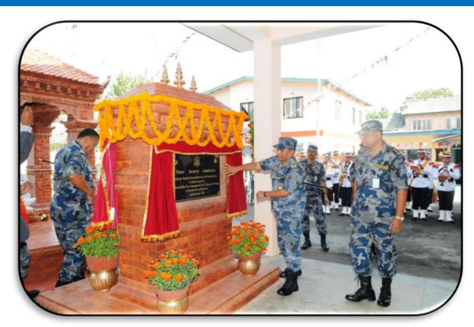
Inauguration of APF Command and Staff College by Former IG Koshraj Onta