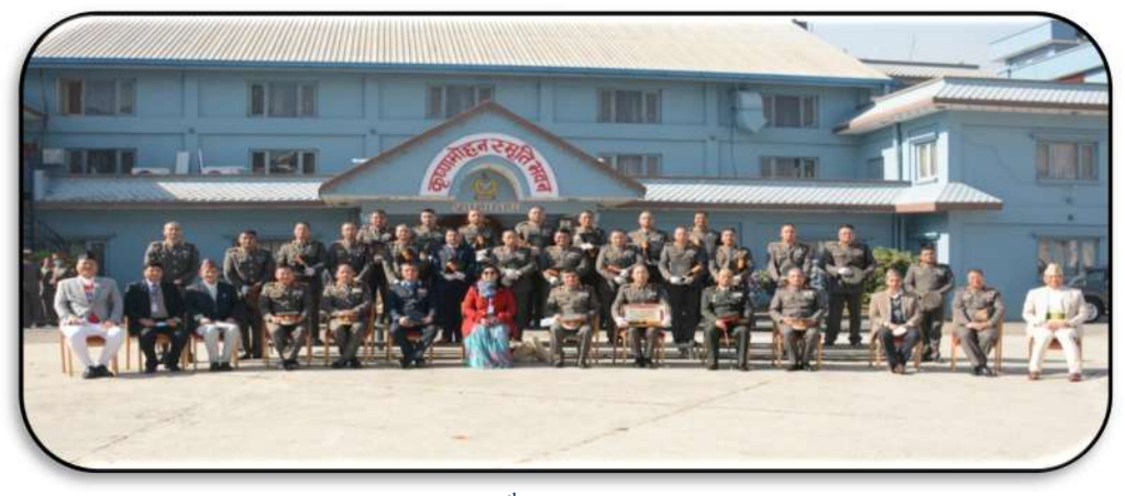
Graduation Ceremony of 5^{\rm th} APF Command and Staff Course