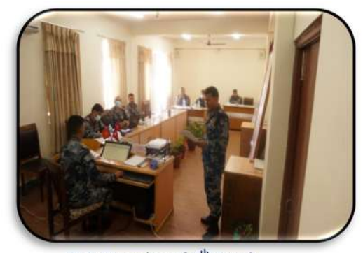
INT Exercise of 6th Batch