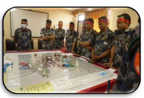
War Game during Campaign Planning Exercise of 6<sup>th</sup> Batch