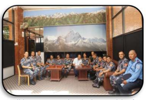
Tribhuvan International Airport Visit of 6<sup>th</sup> Batch